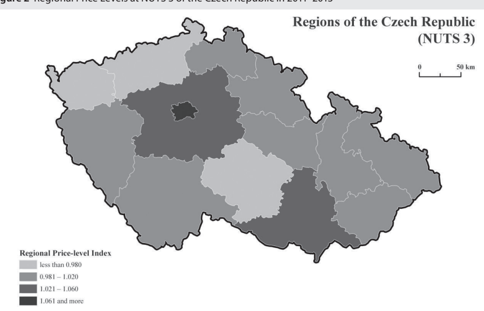
Figure 2 Regional Price Levels at NUTS 3 of the Czech Republic in 2011–2013